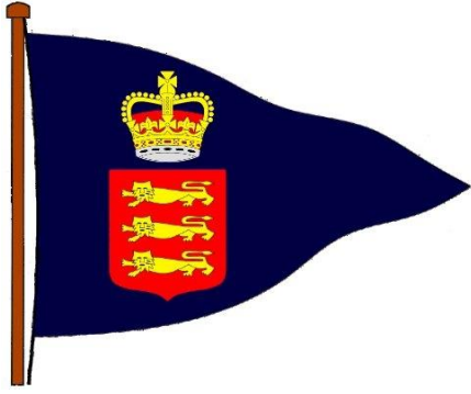
Royal Channel Islands Yacht Club